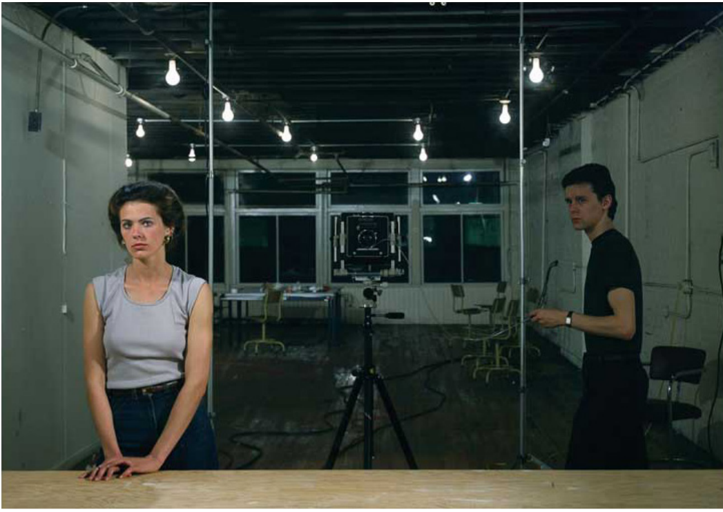
Jeff Wall, Picture for Women , 1979