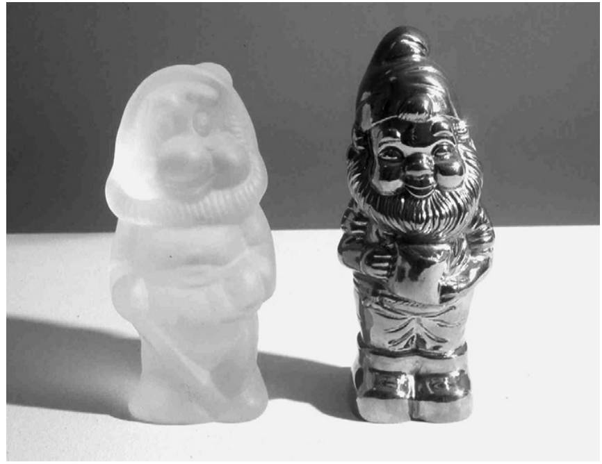
Sherrie Levine, Avant-Garde and Kitsch , 2002