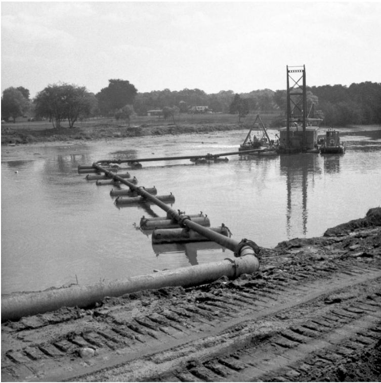
Robert Smithson, Monuments of Passaic , 1967