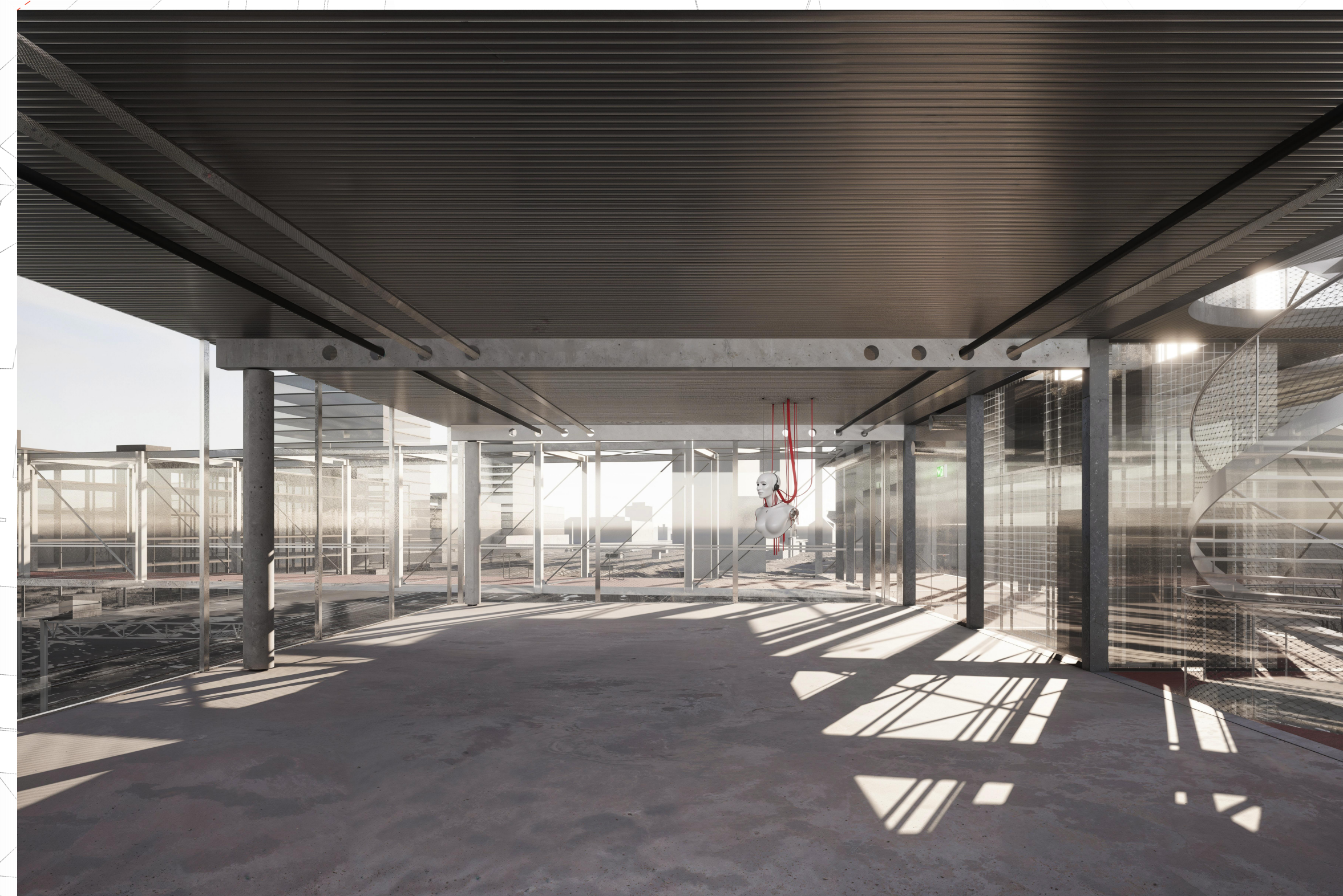
HIGH-RISE TYPOLOGY main space for offices, seminar rooms etc. on the left and the supergrid structure for circulation & building systems on the right