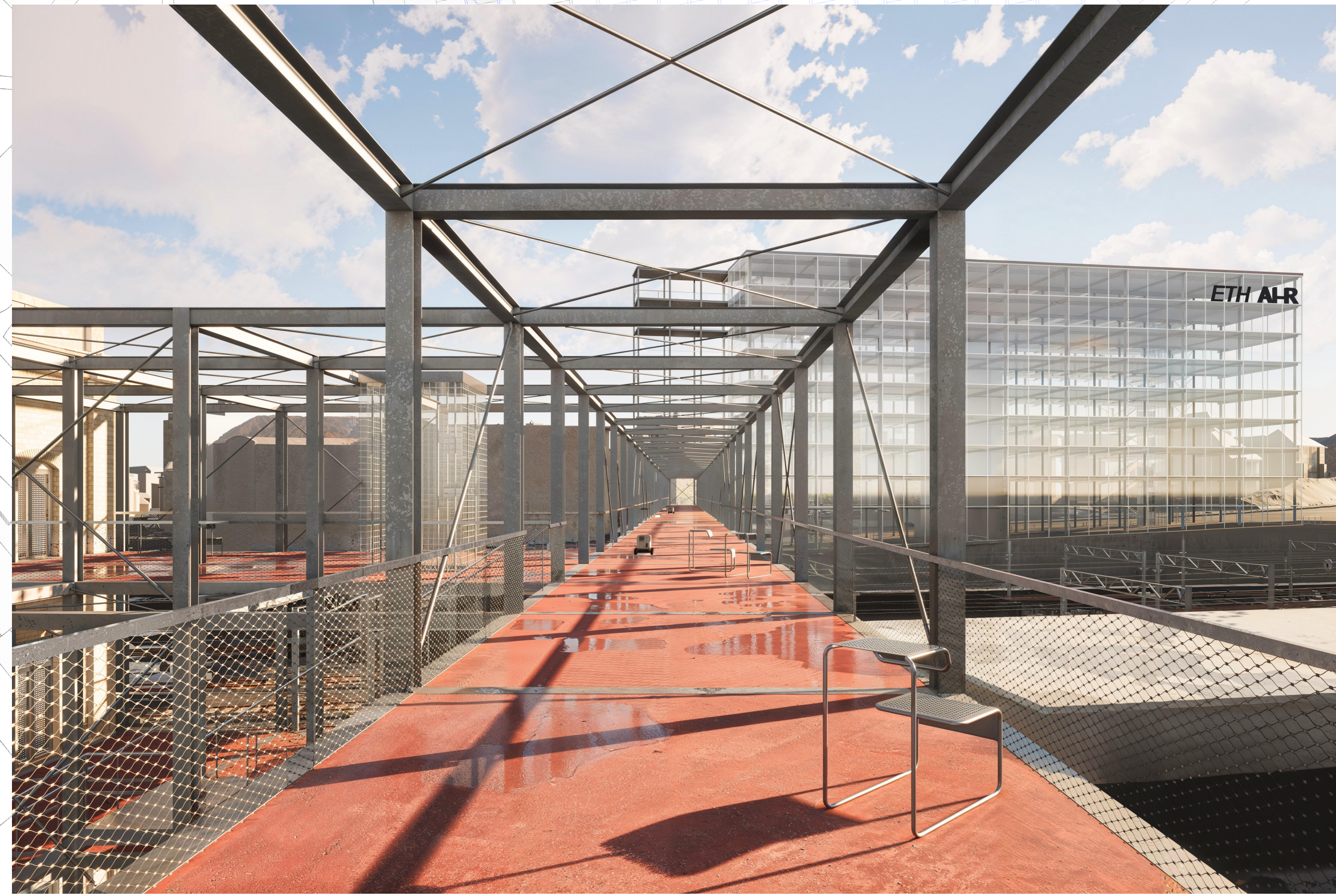
FOR THE PUBLIC the new passerelle with its public spaces connects old- and new-oerlikon and at the same time creates a bridge between innovation and regulation