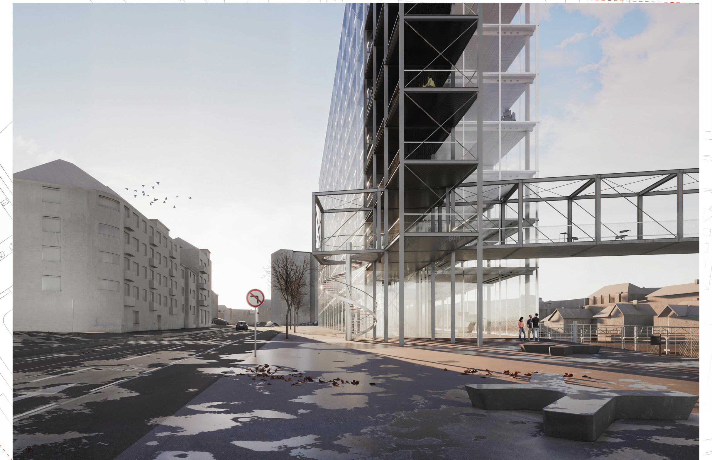
PRELUDE IN OLD-OERLIKON high-rise building on the old-oerlikon side for control and regulation of AI, which also serves as an education center for the public