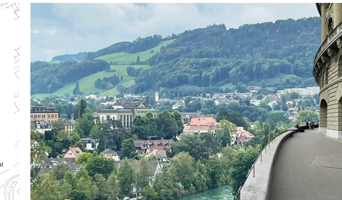
Vis-a-vis Bundeshaus - Bundesarchiv

The Federal Archives are already part of Bern's most important museum cluster, surrounded by 10 museums, the National Library, and the City Archive. Together, these institutions attract approximately half a million visitors annually. Urban development plans to strengthen the connection between these institutions aim to double annual visitors. The future Federal Archives should be a part of this museum cluster.