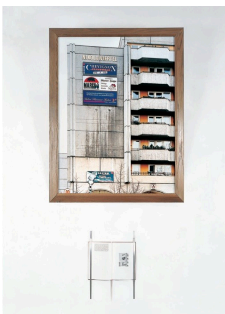
Sophie Calle (1953-) The Detachment, 1996