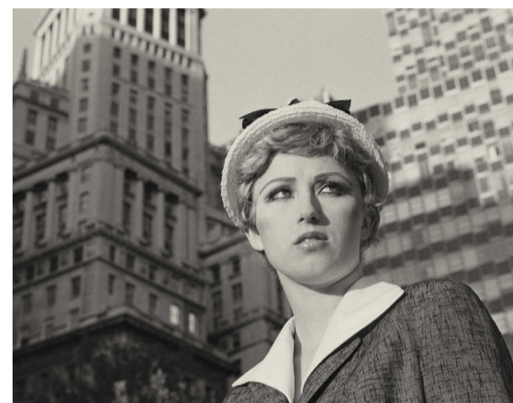
Cindy Sherman (1954-) Untitled Film Still #21, 1978