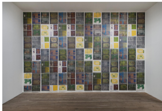
Gordon Matta-Clark (1943-1978) Walls Paper 1972