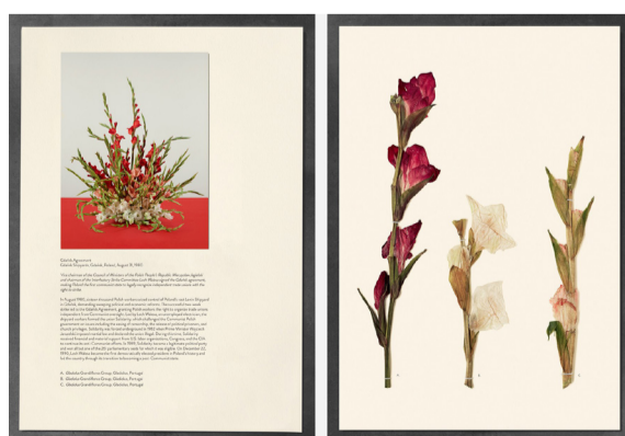
Taryn Simon (1975-) Paperwork and the will of capital, 2015