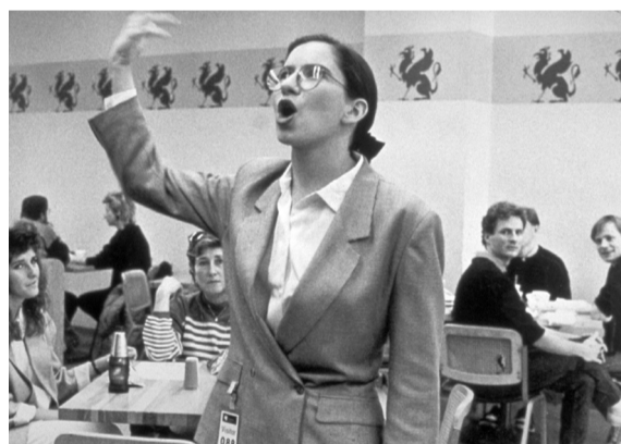
Andrea Fraser (1965-) Museum Highlights: A Gallery Talk 1989