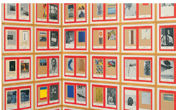
Hanne Darboven (1941-2009) Cultural History, 1880-1983