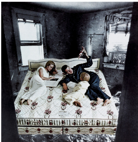
Martha Rosler (1943-) House Beautiful: Bringing the War Home. 1967-72