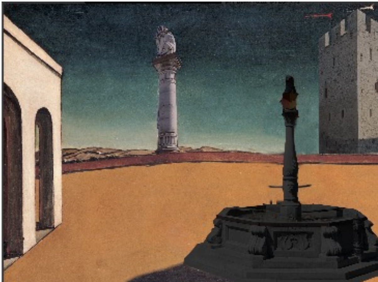
PhotoCollage by Silvan Muff with the painting of Girogo de Chirico's „L'enigma di una gironata“ from 1914

This work was conducted during a class Sociology of Memories at ETH Zurich in the Spring semester 2020.